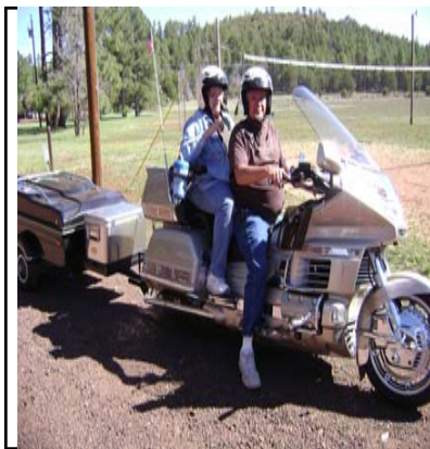
2nd Annual Sirrine Motorcycle Run